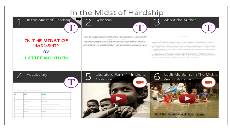
Figure 2. Snapshot of the Edmodo site

Some snapshots of the site are highlighted in Table 2.